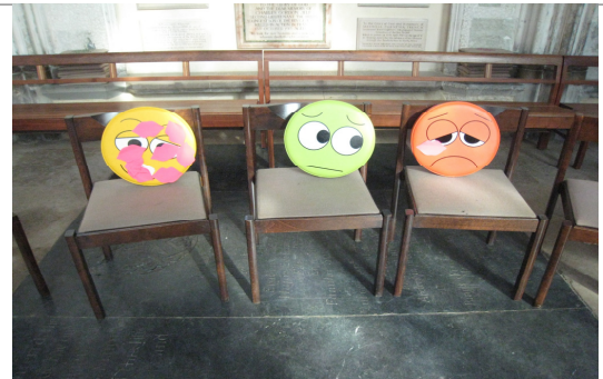
What the students thought!

... Is just one of the comments from Abbey Court School who joined us to pilot our Dance Project workshop – The Calming of the Storm.